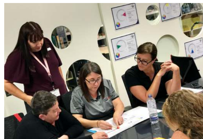
Middle: Manyallaluk Parent Consultative Group meeting