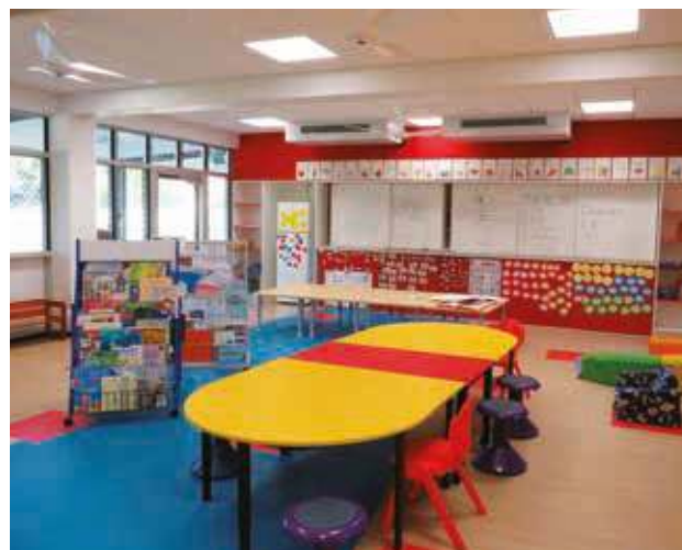
Above and right: Opening of Stage 1 of Ludmilla Primary School